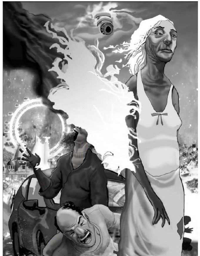
The Seeds of Time (art by Stephen Broome)