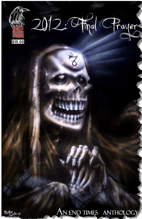
Cover art by Preston Asevedo

When I embarked on this anthology my wife was worried. "First you write stories about people murdering people and now you graduate to destroying the whole human race. What kinds of freak are you?" It's no wonder that my 3-year old is suddenly terrified of